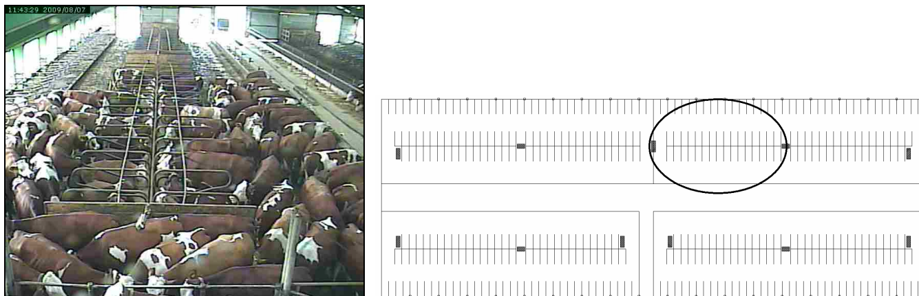
Pictures 1 and 2: Example of self-willed cow crowding in one part of the stable

BLUE group (Picture 3). Our hypothesis was that the cows more frequently standing in feeding fence (FF) are higher ranked than those standing more frequently in dunging passage (DP).